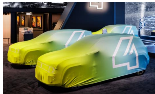
Renault 4 - 7717277962