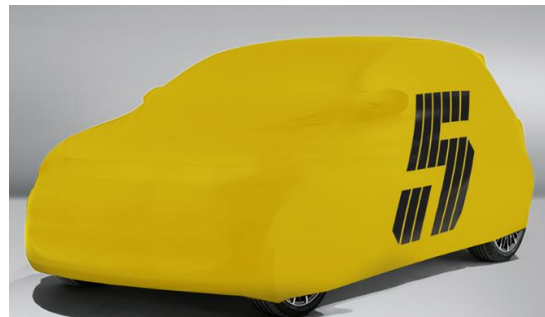
Renault 5 - 7717274271