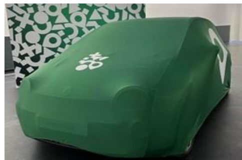
Twingo – 8201762520