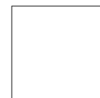
BLANC RAL 9010